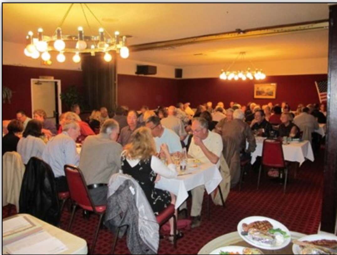
Group photo of everyone having a good time at the Installment Dinner