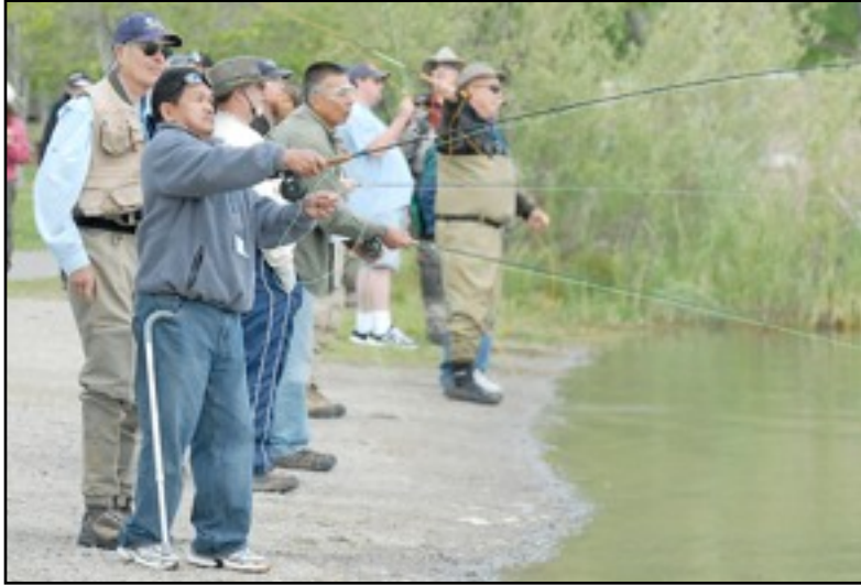
Line up of Veterans fly fishing