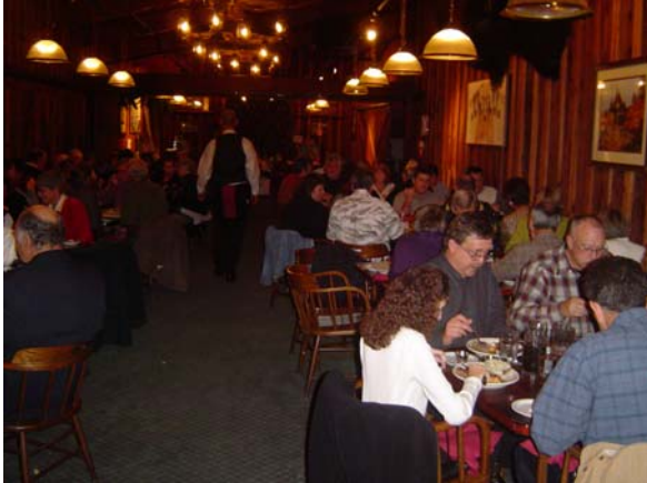
Members eating dinner