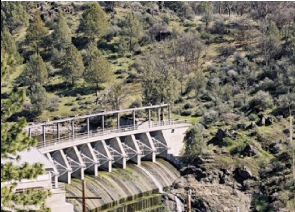
Copco No. 1 dam on the Klamath River outside Hornbrook, Calif.

http://thinkprogress.org/climate/2014/10/07/3576715/california-drought-hydropower/